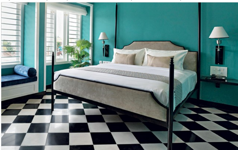
Art Deco style rooms at the boutique hotel

Design hotels are the new cool and the brief is clear: cater to a new breed of travellers who value aesthetics and are happy to choose boutique over brand. The Ayana, Fort Kochi is one such property that is chic, artsy and draws those who want to retire for the night in a room that's aesthetic and pleasing. With just 16 rooms that lie inside a rambling building which is two centuries old, the original structure stands restored and the interiors reflect an Art Deco-style sensibility. While the hotel is located on a bustling street, once you enter its fold, the din is forgotten as the high ceilings, checkered tiles and lofty architecture takes you back in time.