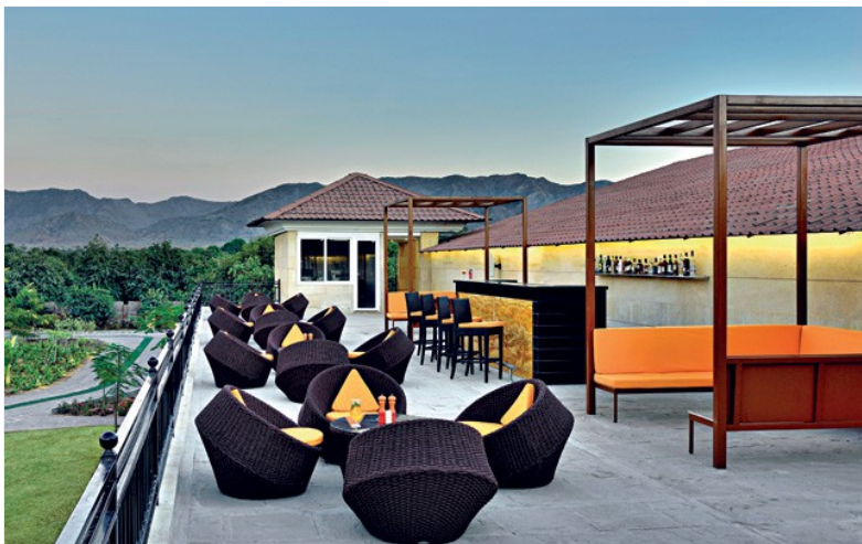
Sunset at Panorama, the rooftop restaurant

Pleasures of plenty Just short of an all-suite hotel, this property has only 18 rooms to 80 suites and villas, of which 44 villas and suites are sumptuously staffed with private pools, both indoor and outdoor. Dining and entertainment options offer a variety of casual and gourmet experiences with Seasonal Tastes, the signature all-day dining venue leading the roost. The fairly comprehensive menu includes, Indian, regional, oriental and continental options but we highly recommend the regional cuisine, especially Rajasthani, which is superlative. Eat well is a Westin dictum, and is followed with minimum fuss, clean flavours, innovative pairings and fresh ingredients-herbs and veggies are sourced from their very own farms bordering the property.