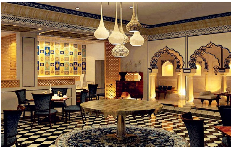
The lounge area features Rajasthani decor and motifs

The staff is attentive without being obtrusive, and great care has been taken to ensure your entire experience borders on informal as you have hosts rather than a reception catering to your needs. With an ample pool overlooking fields of green, a play area for children, a gym and a spa that is located in the belly of the fort, time is inconsequential as you follow the sun at the Alila Fort. The Jaipur Gharana architecture features prominently at the fort with touches of Mughal design incorporated as well. In order to ensure there is some assimilation with the neighbouring village, the hotel organises village tours where you can indulge in some pottery, see a carpet being woven, eat a traditional home-cooked Rajasthani meal or just take a lazy camel cart ride through the village as kids and adults alike peep out from behind pillars in an attempt to snap a quick picture.