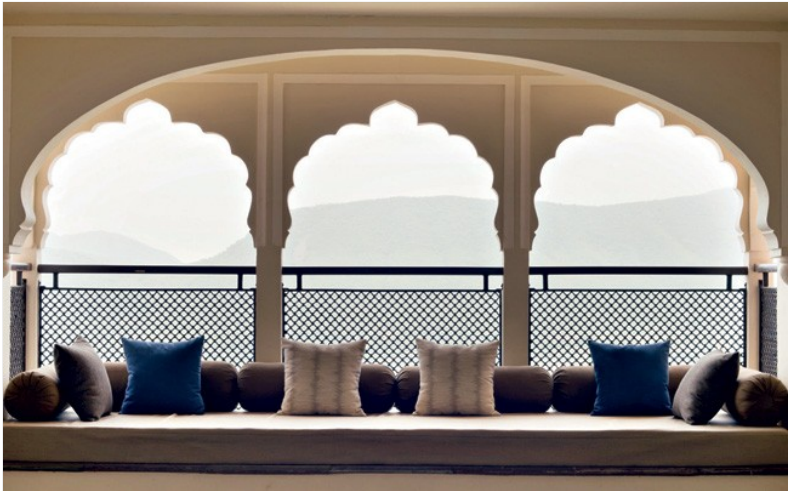
The traditional jharokha-style windows at the resort

There are ample curves and they are more than welcome. The elegant rooms take the shape of the fort and are angular rather than boot cut. It's a relief to find yourself retiring for the night in a hotel room that shrugs conventional shape and at the hotel, while tradition is given weightage, convention is not.