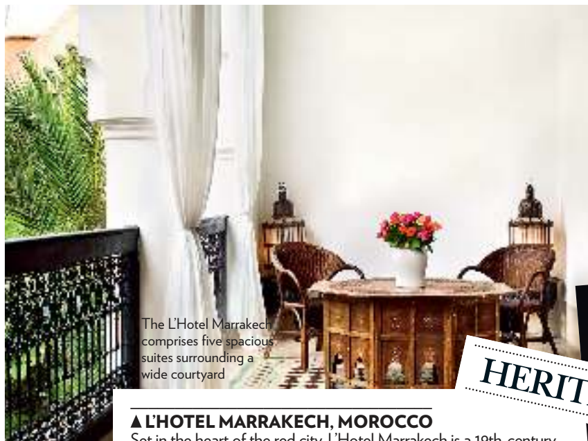
The L'Hotel Marrakech comprises five spacious suites surrounding a wide courtyard