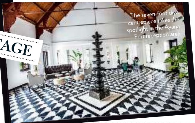
The seven-foot diyā centrepiece takes the spotlight in the Ayana Fort reception area

Set in the heart of the red city, L'Hotel Marrakech is a 19th-century riad, lusciously redecorated by English designer Jasper Conran. His first hotel reflects his Occidental design sensibilities with its whitewashed walls, soothing colours and billowing white voile curtains. The mashrabiya windows, zouak ceilings, zellige tile work and profusion of orange trees in the central courtyard add the requisite Moroccan flourish. L-hotelmarrakech.com