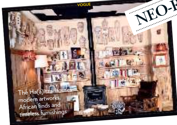
The Ha(a)ïtza houses modern artworks, African finds and timeless furnishings

The 1930s neo-Basque architecture of Ha(a)ïtza has been reimagined by Philippe Starck to give the historical building in France a modern sophistication. Referencing the Dune du Pilat (Europe's tallest sand dune), the rooms are done up in light wood and white tones with a touch of steel and glass, while the pinewood walls in the lobby, the African masks in the lounge and artist Ara Starck's coloured windows in the reception add drama. Haaitza.com