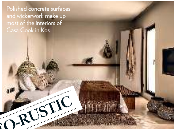
Polished concrete surfaces and wickerwork make up most of the interiors of Casa Cook in Kos

The hotel has been designed to resemble a traditional Greek village, with its mix of one- and two-storey villas built in the local cubist style. The interiors of the 100 rooms have polished, pale grey concrete surfaces offset by furniture in wickerwork, and furnishings in muted browns. Inspired by the concept of paréa where you live with family and friends, the villas have been arranged around a series of shared courtyards. Casacook.com