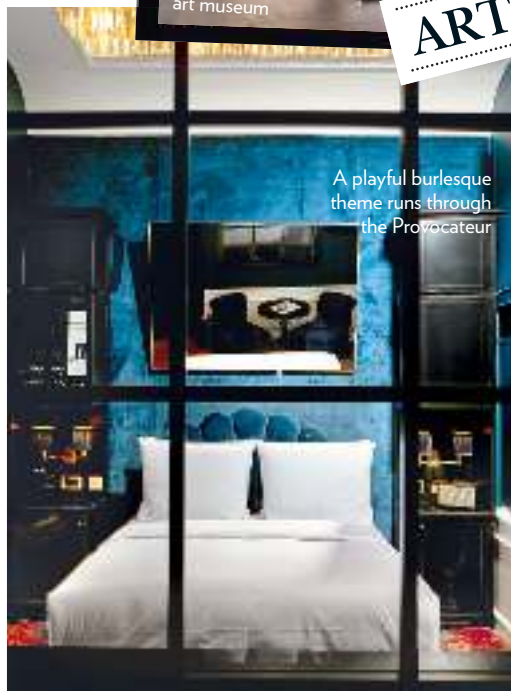
A playful burlesque theme runs through the Provocateur

Berlin's ultra-glam hotel is an homage to the roaring 1920s. The cult of the Parisian salon finds expression in the interiors designed by Saar Zafrir. Press a button to turn on the 'Provocateur mode' and your room is filled with music and images projected on the walls. The use of red and blue tones and soft textures throughout the hotel makes it warm and mysterious. Provocateur-hotel.com