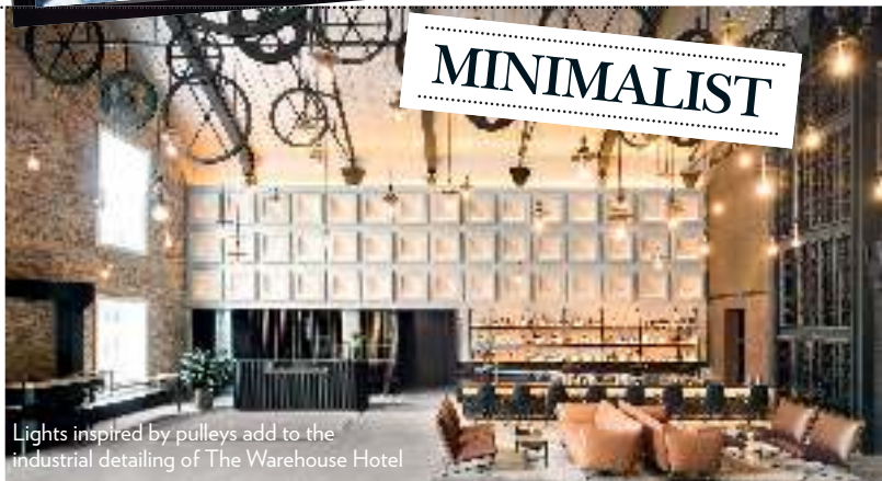
Lights inspired by pulleys add to the industrial detailing of The Warehouse Hotel