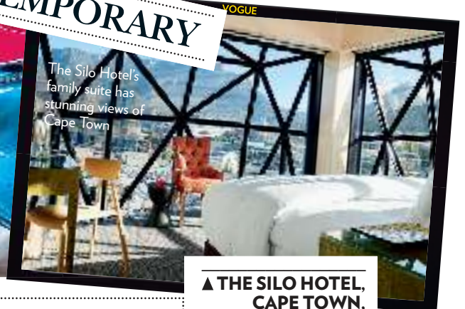
The Silo Hotel's family suite has stunning views of Cape Town

Lounge in a millennial-friendly 19 th century Moroccan riad or dip into a pink-tiled infinity pool inside a renovated spice godown. PRACHI JOSHI scours the planet to find the 10 hottest design-led boutique hotels