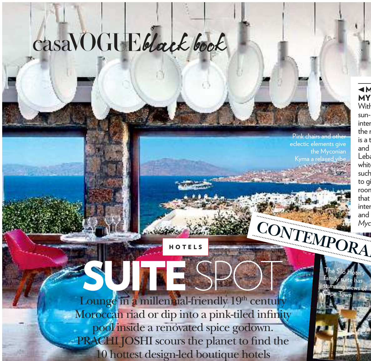
Pink chairs and other eclectic elements give the Myconian Kyma a relaxed vibe